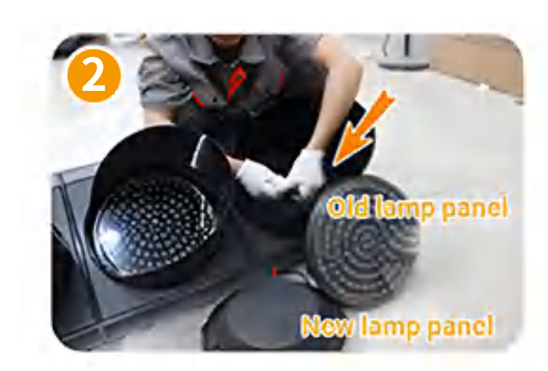
Insert new light cable