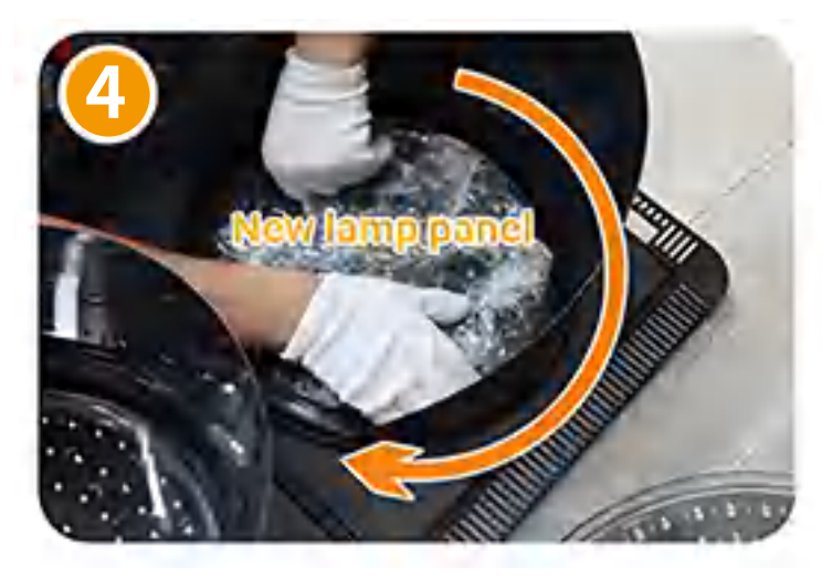
Install new light panel