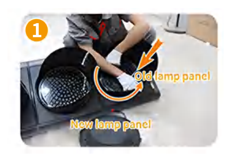
Remove the original lamp panel