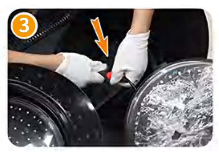
Unscrew the cable and unplug it